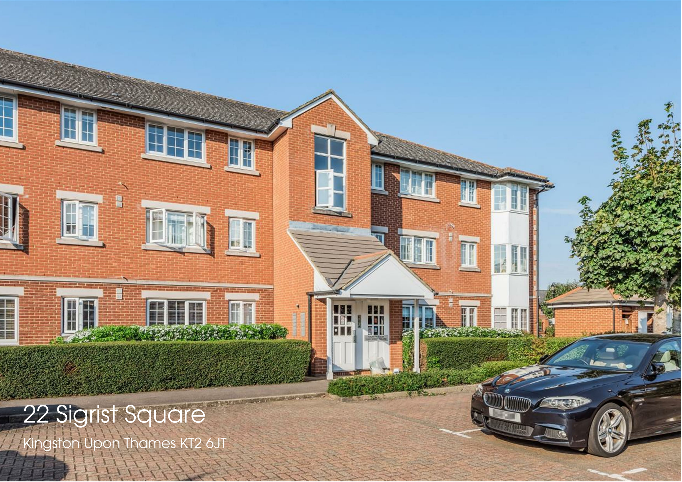
22 Sigrist Square Kingston Upon Thames KT2 6JT

34 Richmond Road Kingston upon Thames Surrey KT2 5ED www.gibsonlane.co.uk Tel: 020 8546 5444